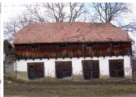
Viscri community barn in sketches and photos.

A community action planning exercise was also conducted, which identified priority needs within the community, raised awareness about the importance of cultural heritage and built support for the establishment of a cultural landscape protection area.